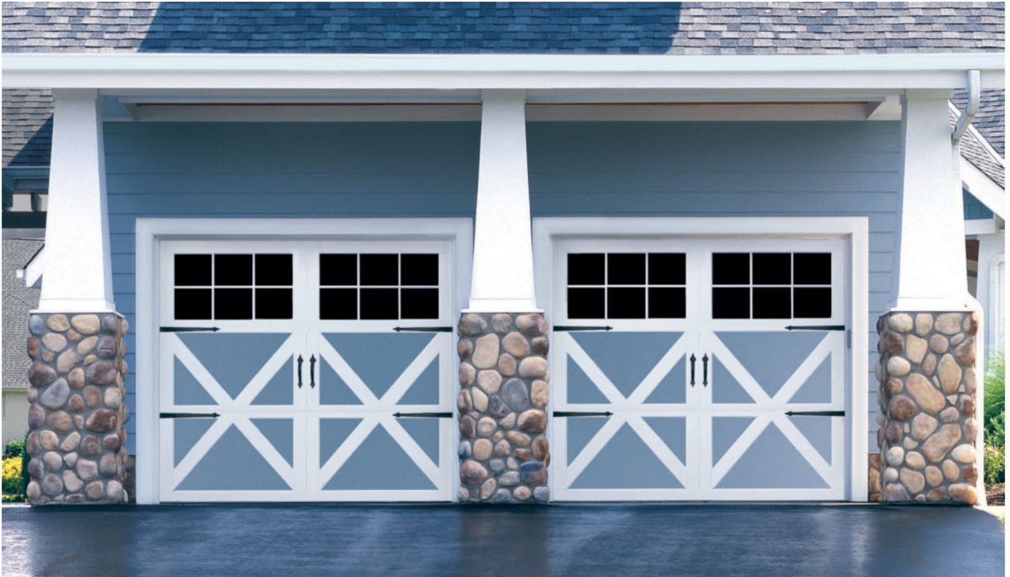
Model 9700 shown in Lexington design with 12 window square and optional decorative hardware